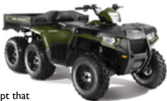
Polaris Big Boss